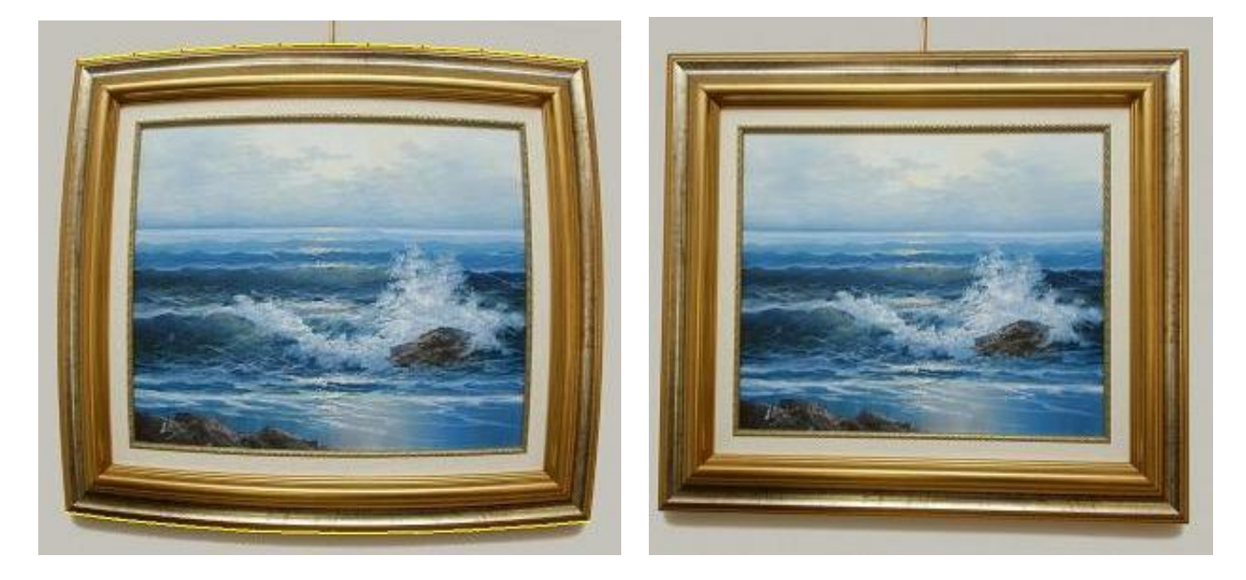
Figure 2: Frame. Left, distorted original image. Right, corrected image.